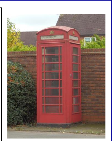
A good place for village information?

The red telephone box is no longer operable and is in the process of being decommissioned and handed over to the Parish Council. In future years the phone box will be judged as a village feature. It is hoped that the box will become a village amenity and the Parish Council is inviting suggestions for its usage from residents. Please pass ideas and suggestions to any member of the Parish Council.